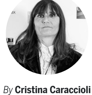
April 09 2020

and the assessments made - based on Article 9 Testo unico delle imposte sui redditi (TUIR) - potential liability scenarios related to the crime of unfaithful declaration could open up.